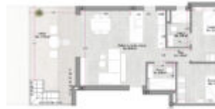
21. Plan Floor 'W' / Corridor

© 2018 by the author. All rights reserved. No part of this publication may be reproduced, stored in a retrieval system, or transmitted, in any form or by any means, electronic, mechanical, photocopying, recording, or by any information storage and retrieval system, without prior written permission from the author.