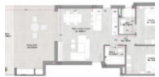
18. Plan Floor 'W' / Corridor

© 2018 by the author. All rights reserved. No part of this publication may be reproduced, stored in a retrieval system, or transmitted, in any form or by any means, electronic, mechanical, photocopying, recording, or by any information storage and retrieval system, without prior written permission from the author.