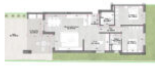
17. Plan Floor 'W' / Corridor

© 2018 by the author. All rights reserved. No part of this publication may be reproduced, stored in a retrieval system, or transmitted, in any form or by any means, electronic, mechanical, photocopying, recording, or by any information storage and retrieval system, without prior written permission from the author.