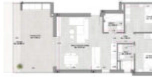
20. Plan Floor 'W' / Corridor

© 2018 by the author. All rights reserved. No part of this publication may be reproduced, stored in a retrieval system, or transmitted, in any form or by any means, electronic, mechanical, photocopying, recording, or by any information storage and retrieval system, without prior written permission from the author.