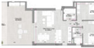
19. Plan Floor 'W' / Corridor

© 2018 by the author. All rights reserved. No part of this publication may be reproduced, stored in a retrieval system, or transmitted, in any form or by any means, electronic, mechanical, photocopying, recording, or by any information storage and retrieval system, without prior written permission from the author.