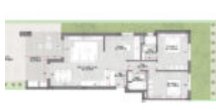
16. Plan Floor 'W' / Corridor

© 2018 by the author. All rights reserved. No part of this publication may be reproduced, stored in a retrieval system, or transmitted, in any form or by any means, electronic, mechanical, photocopying, recording, or by any information storage and retrieval system, without prior written permission from the author.